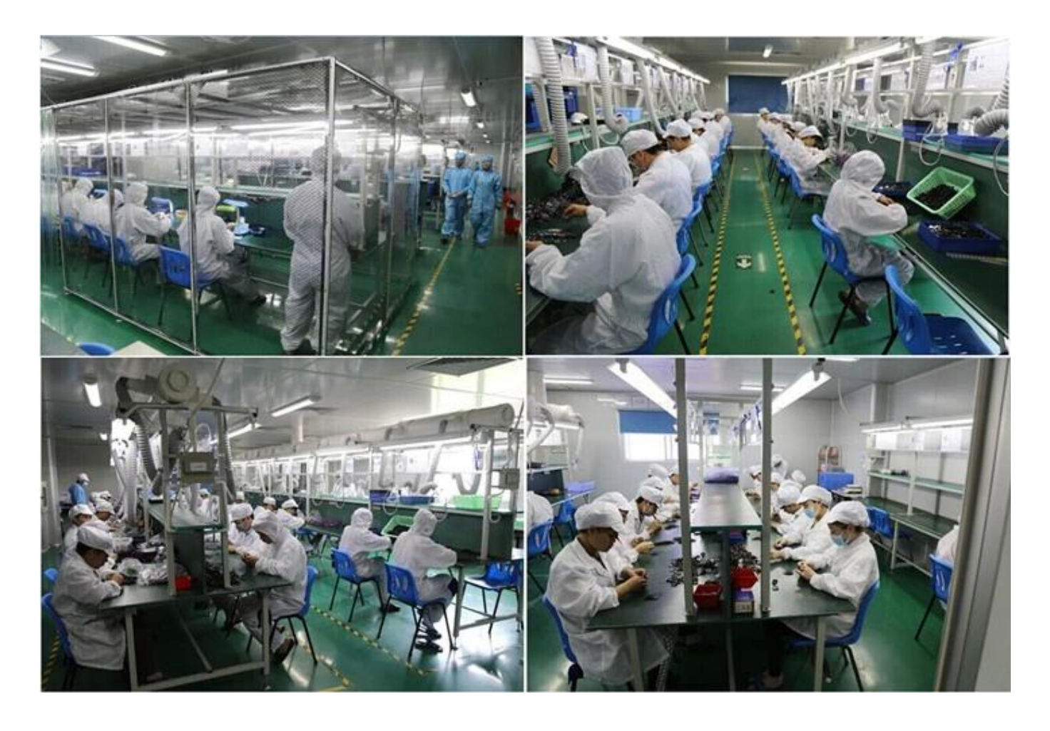
welcome to contact with us!